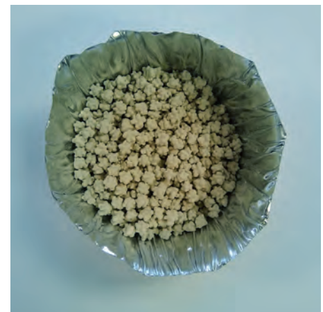
Figure 6. Asteroid-shaped seed pellets.