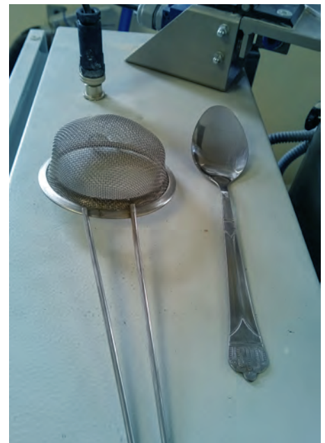
Figure 3. Kitchen tablespoon and kitchen sieve for clay powder application.