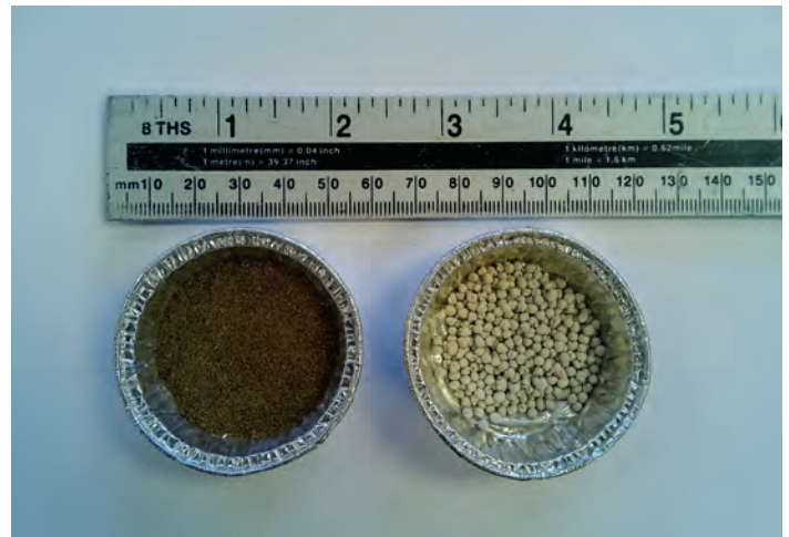
Figure 1. Fireweed ( Chamerion angustifolium ) un-pelleted seeds (left) and pelleted seeds (right, No. 10 (2 mm) sieve).