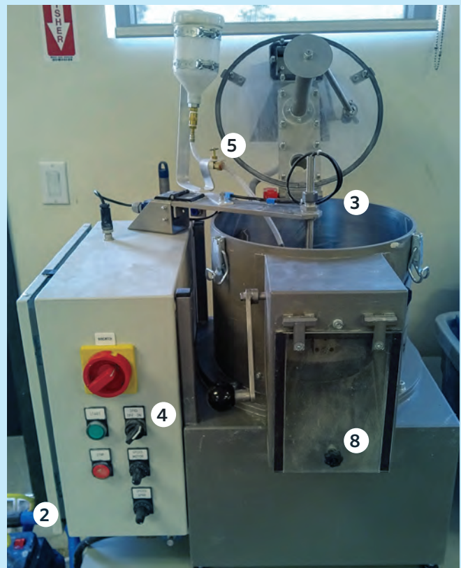
Figure 4. Seed pelleting machine. Numbers indicate selected steps in above list.