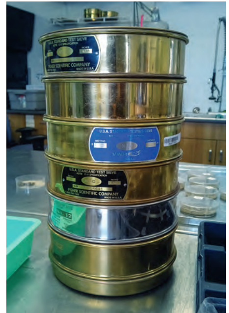
Figure 2. Sieves for sorting seed pellets by size.