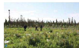
Figure 6. Selective vegetation control (spraying) to manage plant community composition.