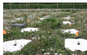
Figure 4. Seedlings within dense grass cover.