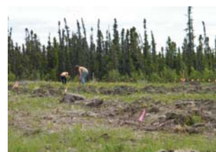
Figure 5. Crew treeplanting a reclaimed wellsite access road.