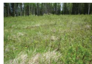
Figure 3. Abandoned wellsite with natural ingress. Vegetation meets 2010 Reclamation Criteria for Forested Lands due to combination of tall shrub and tree species density