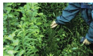
Figure 2. Abundant natural ingress overtopping planted pine.