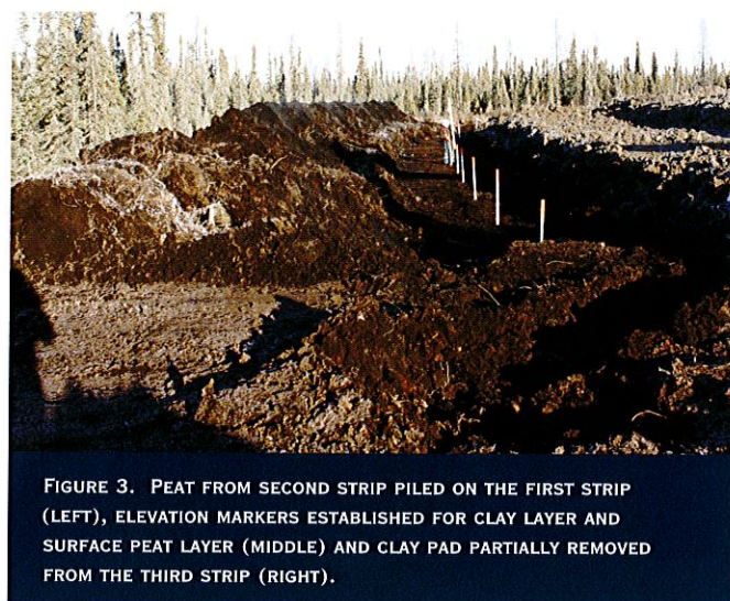
FIGURE 3. PEAT FROM SECOND STRIP PILED ON THE FIRST STRIP (LEFT), ELEVATION MARKERS ESTABLISHED FOR CLAY LAYER AND SURFACE PEAT LAYER (MIDDLE) AND CLAY PAD PARTIALLY REMOVED FROM THE THIRD STRIP (RIGHT).