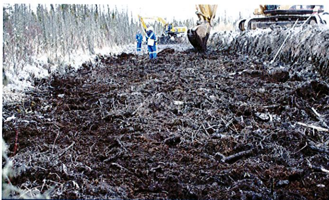
FIGURE 1. COMPLETE REMOVAL OF CLAY PAD WITH FLUFFING/DECOMPACTION.

pilot project addresses the hydrology, civil earth works, and plant - community considerations of restoring large scale, unconventional, 'in situ' wellpads that are typically located in sensitive wetland ecosystems. The site adjustments tested in this trial should aid in restoring surface peat hydrologic connectivity with the surrounding peatland and in creating a stable saturated - but not inundated - surface for deployment of the moss and other shrub and tree species present in the surrounding natural peatland. The outcome of this project is to contribute to the development of peatland restoration criteria currently under development by Alberta Sustainable Resource Development.