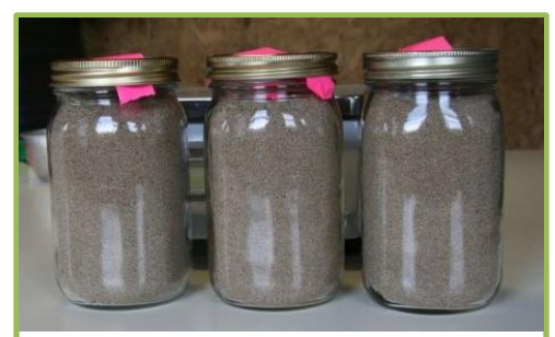
Figure10: Mason jars sealed with clean aspen seed

Seeds loose viability very quickly and should be sown or prepared for storage immediately after cleaning. Young and Young (1992) state that storing fully matured and properly dried aspen seeds at 5°C can preserve viability for two years and in extreme cases up to six years. ATISC recommends storage of seeds at -18°C (at a moisture content of 5-8%) to retain viability although there is some indication that a higher moisture content of 8-10% may be more advantageous (Marenholtz 2011).