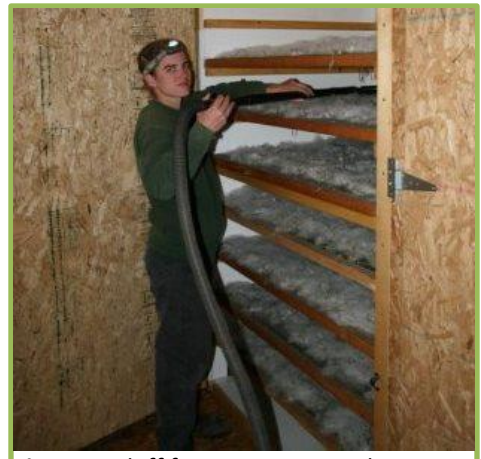
Figure 7: Fluff from Aspen Capsules

As the capsules dry, they will split to release the seeds with the attached white pappus. Spread the catkins out in a thin layer – the fluff needs room to expand (figure 7). If the fluff mats together in the drying process (from the catkins getting moist), it will not open to release the seed. Capsules require 2-4 days under ambient air temperatures to open. Processing before the catkins are completely crisp can help reduce the amount of chaff added to the seed. Fluff can be