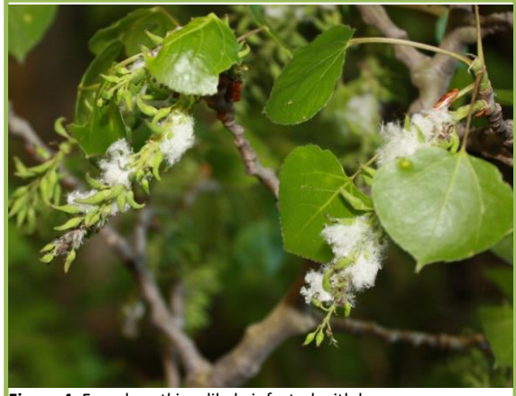
Figure 4: Female catkins, likely infested with larvae

Be aware that some capsules crack prematurely due to insect predation and these can mimic ripe capsules. Catkins infested by insect larva will start to dispel the fluff but the fluff will be clumped and remain attached to the catkin (Figure 4). If insects are found in significant number of catkins from a specific tree or clone, seeds should not be harvested.