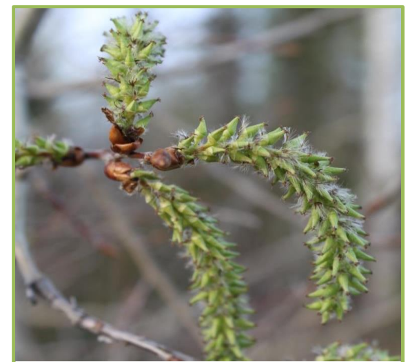
Figure 3: Aspen capsules begin to split open

Once clones have been selected, they need to be monitored daily until seeds mature. Seeds should be harvested when seeds are a light straw colour. Seeds harvested before this time will not ripen and greatly reduce the germinability of the seed lot. Although immature seeds are paler and more translucent than mature seed, it isn't necessary to open up seed capsules to determine seed ripeness. Seeds are mature enough to harvest when the first capsule begins to split open and the white pappus (fluff) begins to break out (Figure 3). As soon as the first capsules crack, begin harvesting the entire clone to prevent loss when felling branches or whole trees. In warm weather the harvest window is three to five days. If there is a cold spell as the fluff begins to fly this window can be extended to seven to 10 days.