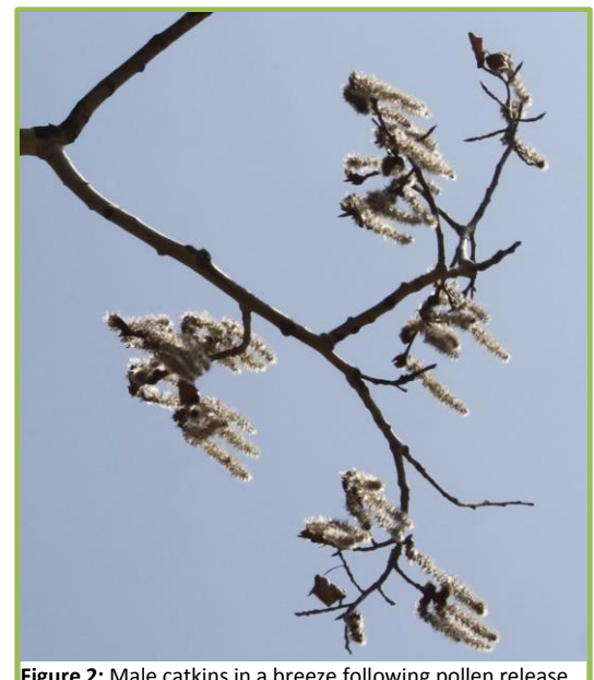
Figure 2: Male catkins in a breeze following pollen release. (F. Terpstra)

Initially male catkins can look slightly pinkish in colour as the anthers are exposed but the colour changes to yellowgreen as the pollen is released and often the entire clones will take on a green yellow hue. Pollination occurs over a period of one or two weeks (Beaubien 2011). After pollen is shed the male catkins shrivel and the females begin to enlarge (Figure 1). The female clones will have a slight green hue as the catkins elongate and capsules start to mature over the next three to four weeks. <u>At this stage a</u>