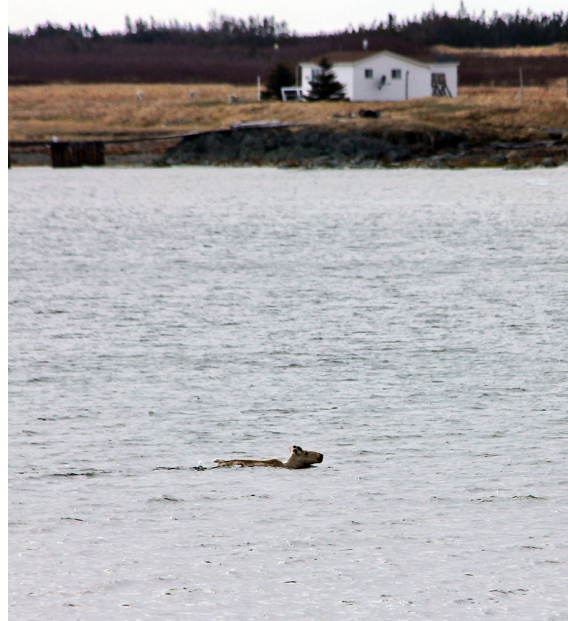
FIG. 1. Photograph of swimming unmarked adult male caribou ( Rangifer tarandus ) from Western Perry Island to Eastern Perry Island, Newfoundland, Canada taken on 30 May 2017.

Our focus on forage is due to the limited presence of predators in our system. Throughout their range, wolves ( Canis lupus ) are the primary predator of caribou. Because there are no wolves on the Island of Newfoundland, coyotes ( Canis latrans ) and black bears ( Ursus