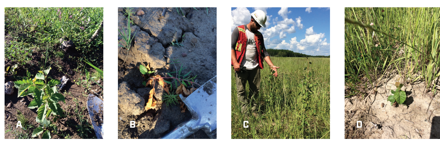
Figure 3 (above). Images from the first growing season illustrating alder established from (a) dormant or (b) hot stock and paper birch in the second growing season illustrating (c) dormant or (d) hot stock.