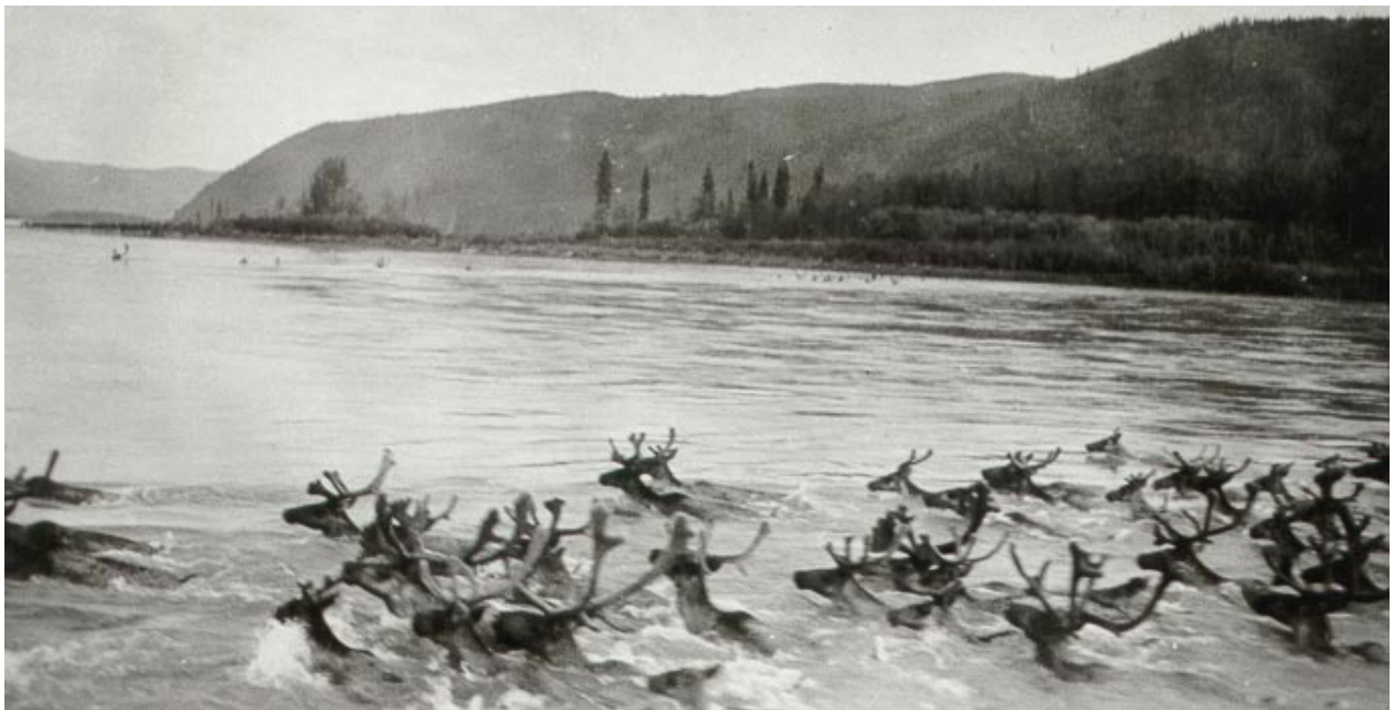
Caribou crossing Yukon River.