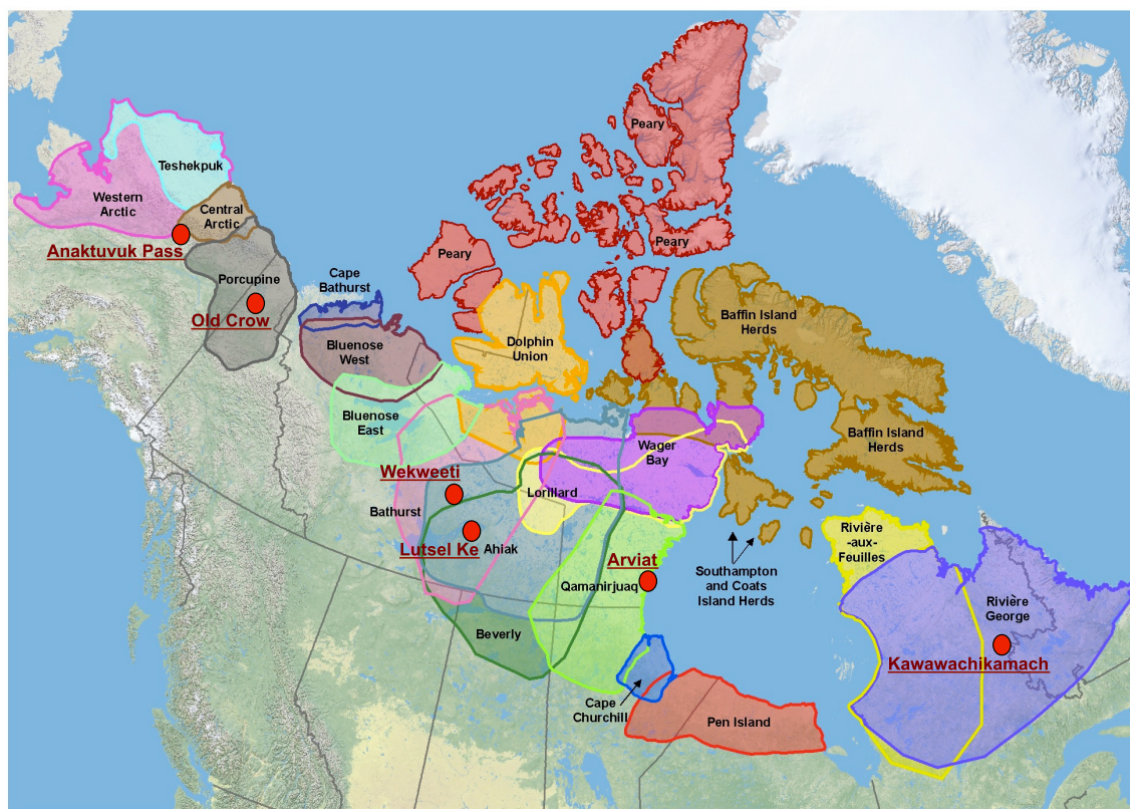
Fig. 2. Map showing the six participating communities of the Voices of the Caribou People project along with the ranges of North American caribou herds (Adapted from Gunn et al. 2011).

dissemination of all the material without any modification from our side, unless the community or the participant desired otherwise.