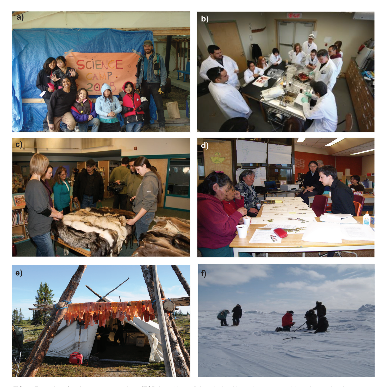
FIG. 2. Examples of early career researchers (ECRs) working collaboratively with northern communities: a) a youth science camp in Old Crow, Yukon: a program initiated by the Vuntut Gwitchin Government, which ECRs helped to coordinate and organize; b) a marine bird dissection workshop held at Nunavut Arctic College in Iqaluit, Nunavut, led by ECRs in partnership with Carleton University and Environment Canada; c) an inaugural Youth Conference on Climate Change in Old Crow, Yukon, where ECRs worked with community leaders to provide workshops; d) community-based plant collections near Sanikiluaq, Nunavut, organized by ECRs and community members; e) Lake trout samples drying in Sahtú traditional territory collected from Great Bear Lake in partnership with community members from Déline, NWT; and f) working with Inuit hunters from Gjoa Haven to conduct non-invasive surveys of polar bear tracks in the M'Clintock Channel, Nunavut.