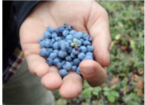
Figure 1: Fort McKay berry project participant holding blueberries