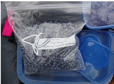
Figure 2: Blueberries ready to be sent for testing

to share and have recorded. Interestingly, in 2012 the group collected berries from each of the patches and took them home, but during the following year when they got to know me better, they told me that they did not consume any of the berries from the patches near Fort McKay, because they did not trust them due to the proximity of the respective patches to oil sands developments. Although the patches near Fort McKay are important historical familial and social places, people now travel much farther to collect berries; or if they are not able to travel, they are unable to access berries they trust are edible. The berries from Moose Lake, the berry patch that is the farthest from Fort