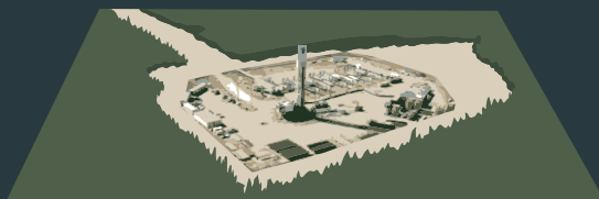
Harvest blocks, fires, and well pads