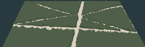
Legacy linear features